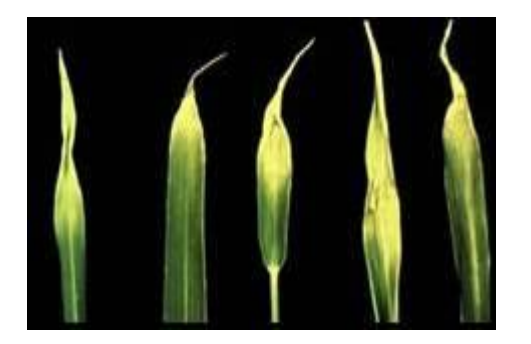
White tip symptom in rice

Leaf discolouration: The leaf tip become white in rice due to rice white tip nematode Aphelenchoides besseyi , yellowing of leaves oin Chrysantyhemum due to Chrysanthemus foliar nematodes, A. ritzemabosi .