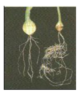
Root – rot: The nematodes feeds on the fleshly structure and resulting in rotting of tissues (eg.) Yam nematode Scutellonema bradys and in potato Ditylenchus destructor cause root rot.

(eg.) Trichodorus christei, Nacobbus spp., Heterodera spp. Meloidogyne hapla and Pratylenchus spp. etc.