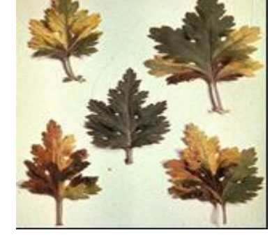
Leaf discoloration in Chrysanthemum

Dead or devitalized buds: In case of straw berry plants infected with A. fragariae , the nematodes affect the growing point and kill the plants and result in blind plant.